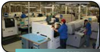
Automated SMT Lines

The document control system at Matric captures printed circuit board data directly from a wide variety of Computer Aided Design (CAD) files. CAD data is used to generate documentation to create bills of material and to program equipment. From data capture to product delivery, Matric is the first choice for quality electronic manufacturing services.