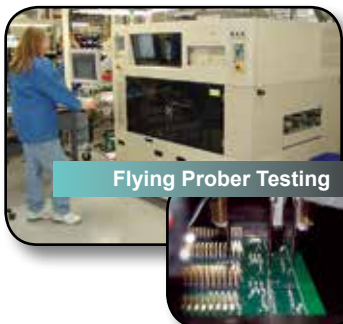
Flying Prober Testing