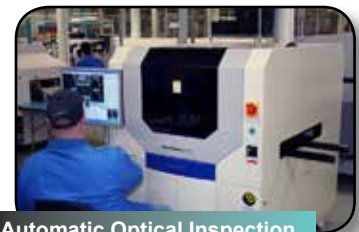
Automatic Optical Inspection